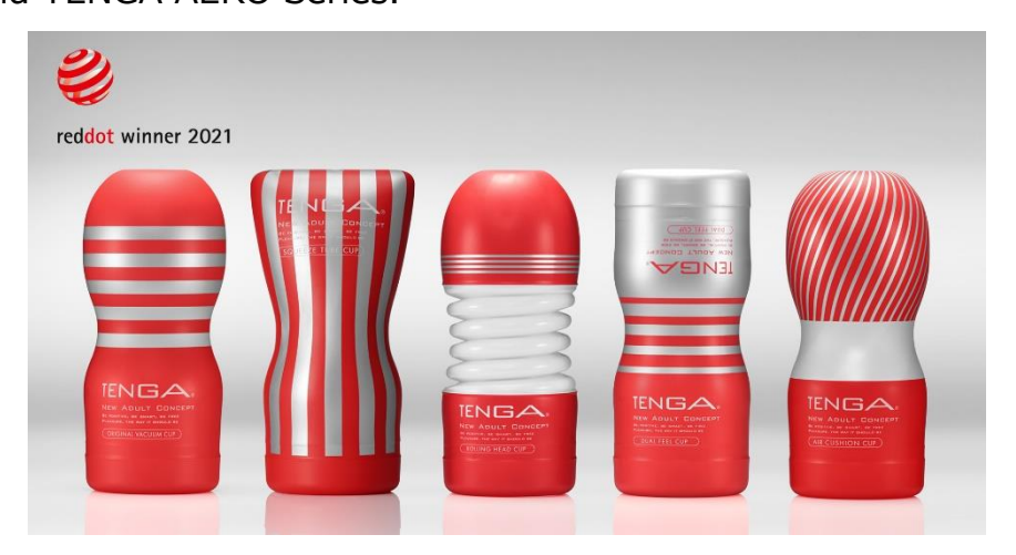
TENGA CUP Series (From left: Original Vacuum CUP, Soft Case CUP, Rolling Head CUP, Dual Sensation CUP, Air Flow CUP)

TENGA also received two further awards of the Red Dot for the TENGA CUP Series and TENGA AERO Series.